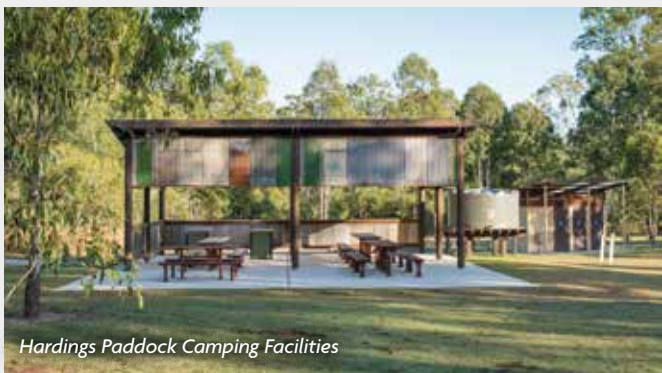
Hardings Paddock Camping Facilities

Enviroplan, together with key documents such as the Nature Conservation Strategy and the Integrated Water Strategy, sets the path for natural resources within Ipswich City. For more information about Ipswich Enviroplan visit Ipswich.qld.gov.au