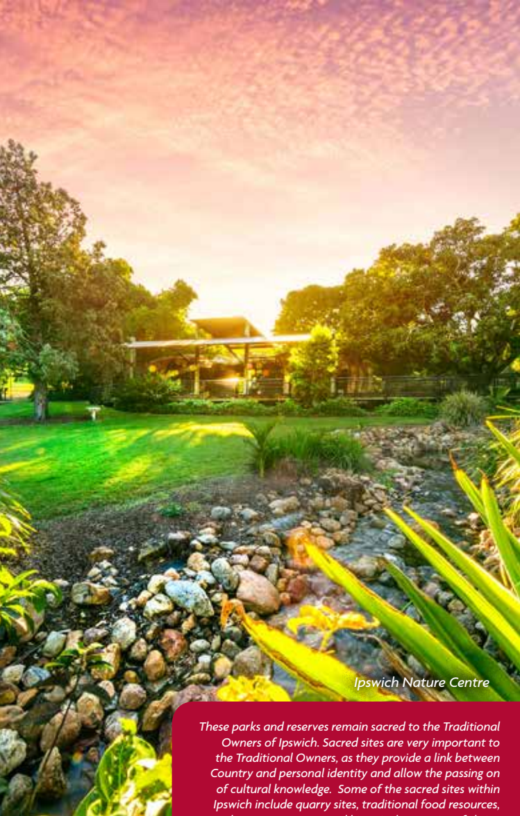
Ipswich Nature Centre

These parks and reserves remain sacred to the Traditional Owners of Ipswich. Sacred sites are very important to the Traditional Owners, as they provide a link between Country and personal identity and allow the passing on of cultural knowledge. Some of the sacred sites within Ipswich include quarry sites, traditional food resources, story places, pre-contact and historical camp sites, fighting grounds, ceremonial sites, bora rings and women's business sites.