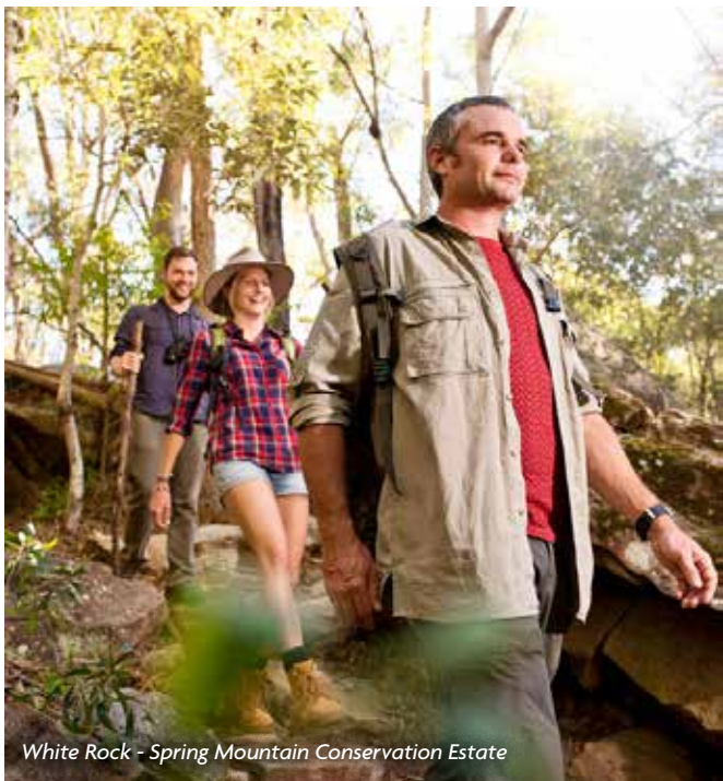
White Rock - Spring Mountain Conservation Estate

Bush camping is available at Hardings Paddock in Flinders-Goolman Conservation Estate.