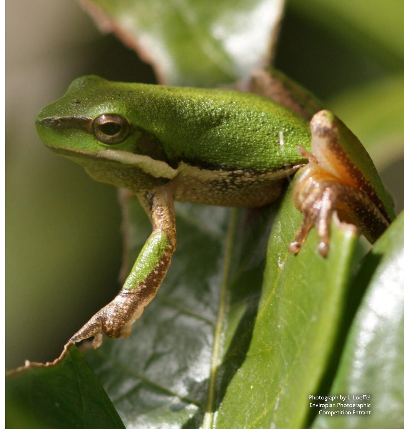
Photograph by L. Loeffel Enviroplan Photographic Competition Entrant