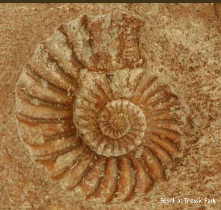
Fossil at Triassic Park

The park is steeped in history with the discovery of fossils and intense coal mining activity early last century. It now functions as a Conservation Park protecting a rich biodiversity so close to the city and even remarkably provides habitat for a local koala population.