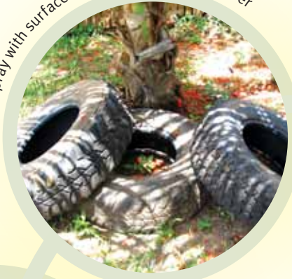
Loose tyres Spray with surface spray and store undercover