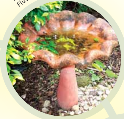
Bird baths Flush out weekly