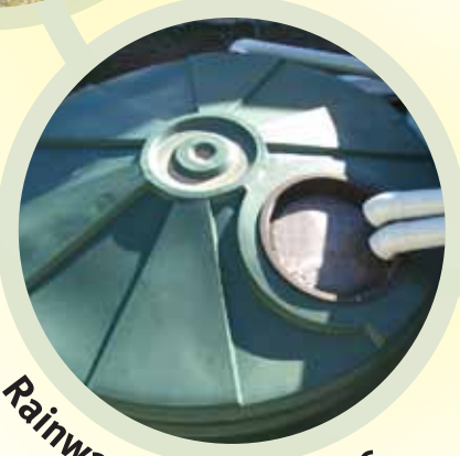
Rainwater tank screens Replace if missing or broken