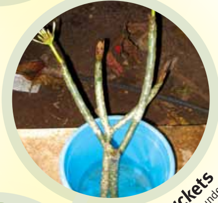
Empty buckets Store upside down or under cover