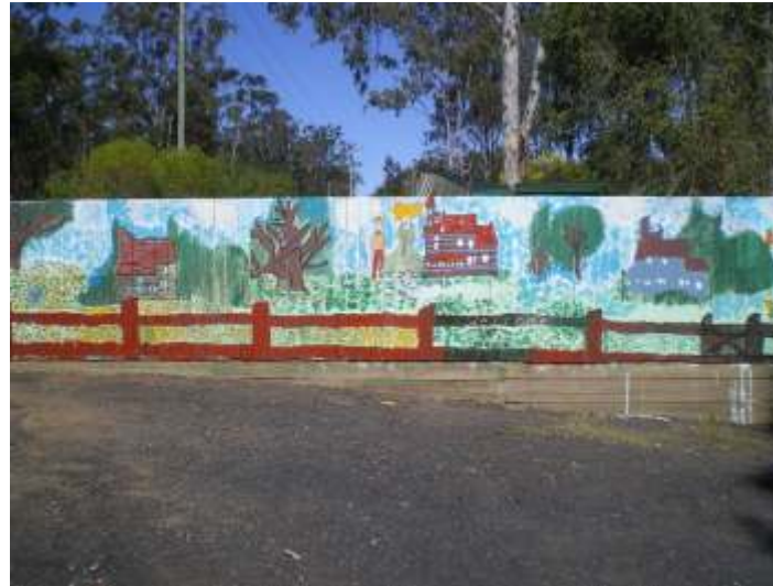
Goodna Special School. Westfalen Community Garden.