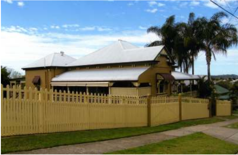
Tim & Jenny Rush for 4 Blackstone Road, Eastern Heights.