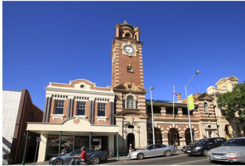
Tower Central Partnerships for Tower Central.