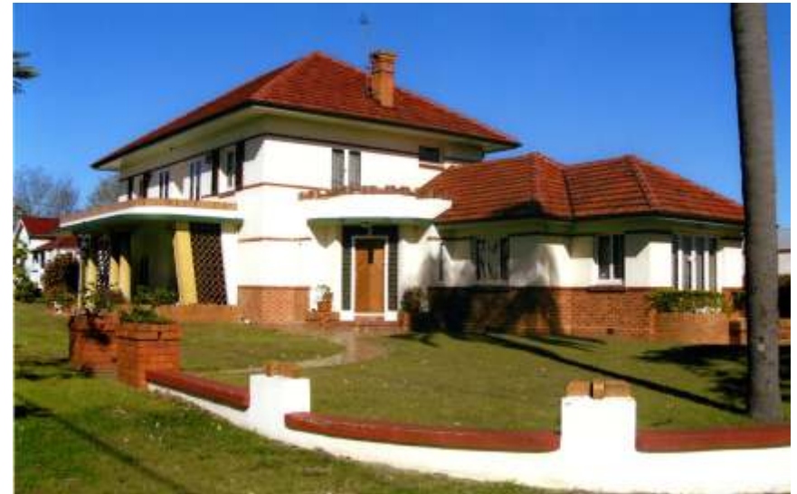
Marcella Beaumont for Beau-Guest, 59 Salisbury Road, Eastern Heights.