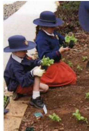
West Moreton Anglican College. The Picking Patch.