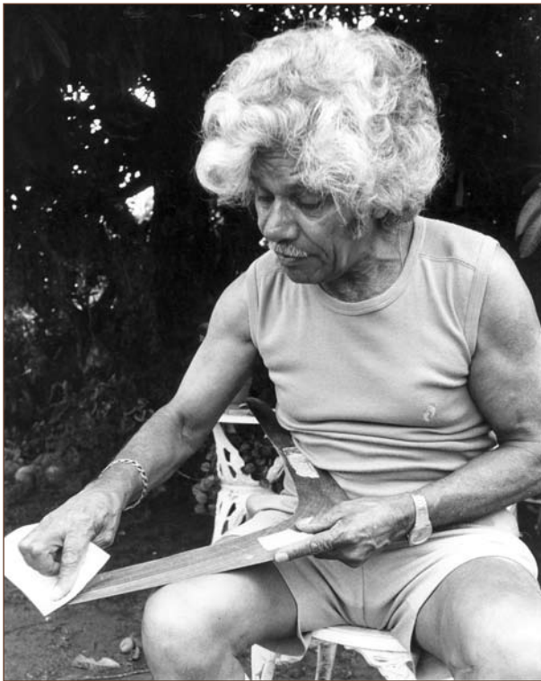
"I started a little boomerang factory.."

They came down and joined me. We lived on the farm for about two years and that cracked up and I moved into Mt Crosby where I worked with the Brisbane City Council out at Lake Manchester for about 12 months. I used to travel from Mt Crosby out to Lake Manchester.