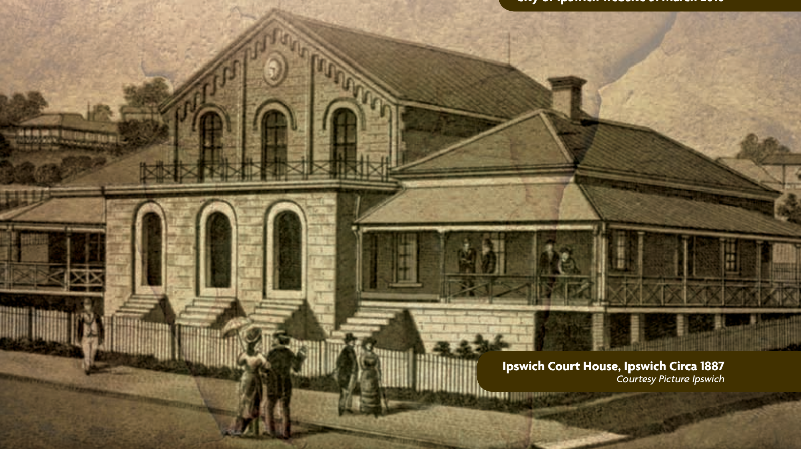
Ipswich Court House, Ipswich Circa 1887

Information courtesy of City of Ipswich website 31 March 2010