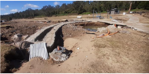
Pictured below - damage at Colleges Crossing caused by flooding in 2022