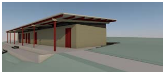
New amenities building - view from car park