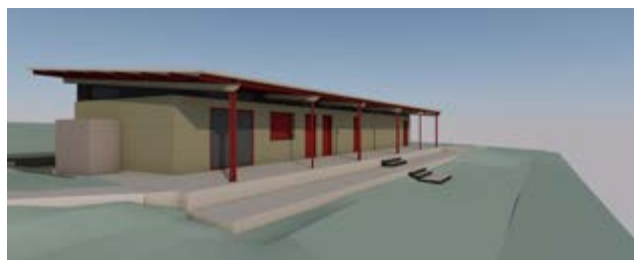
New amenities building - view from netball courts