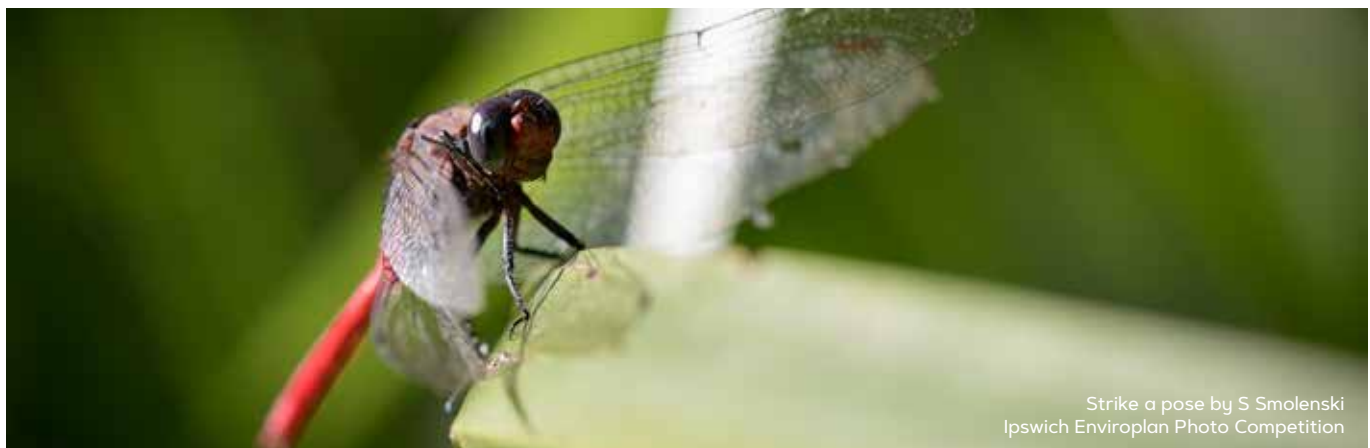
Strike a pose by S Smolenski Ipswich Enviroplan Photo Competition