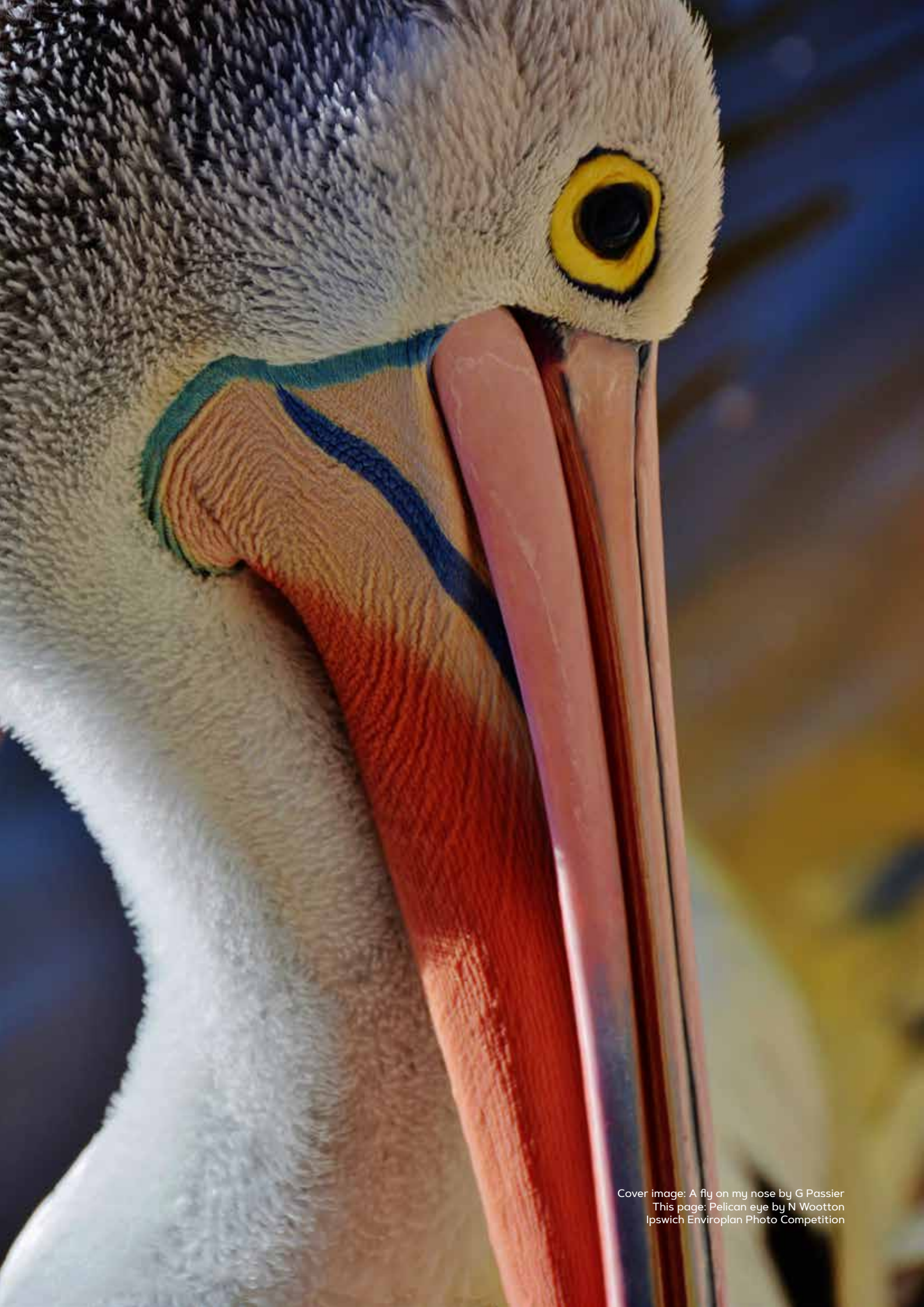
Cover image: A fly on my nose by G Passier This page: Pelican eye by N Wootton Ipswich Enviroplan Photo Competition