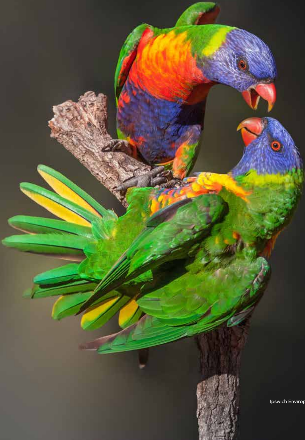
Rainbows by G Passier Ipswich Enviroplan Photo Competition