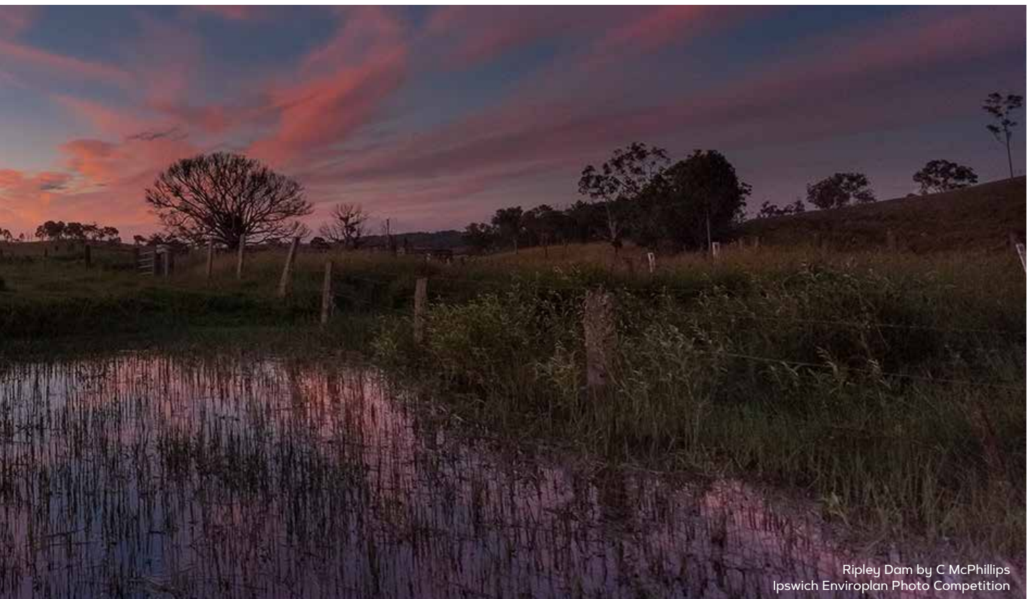
Ripley Dam