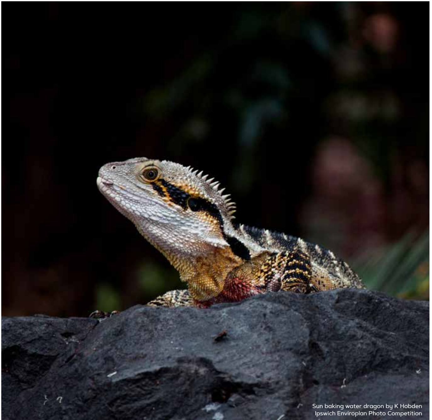
Sun baking water dragon