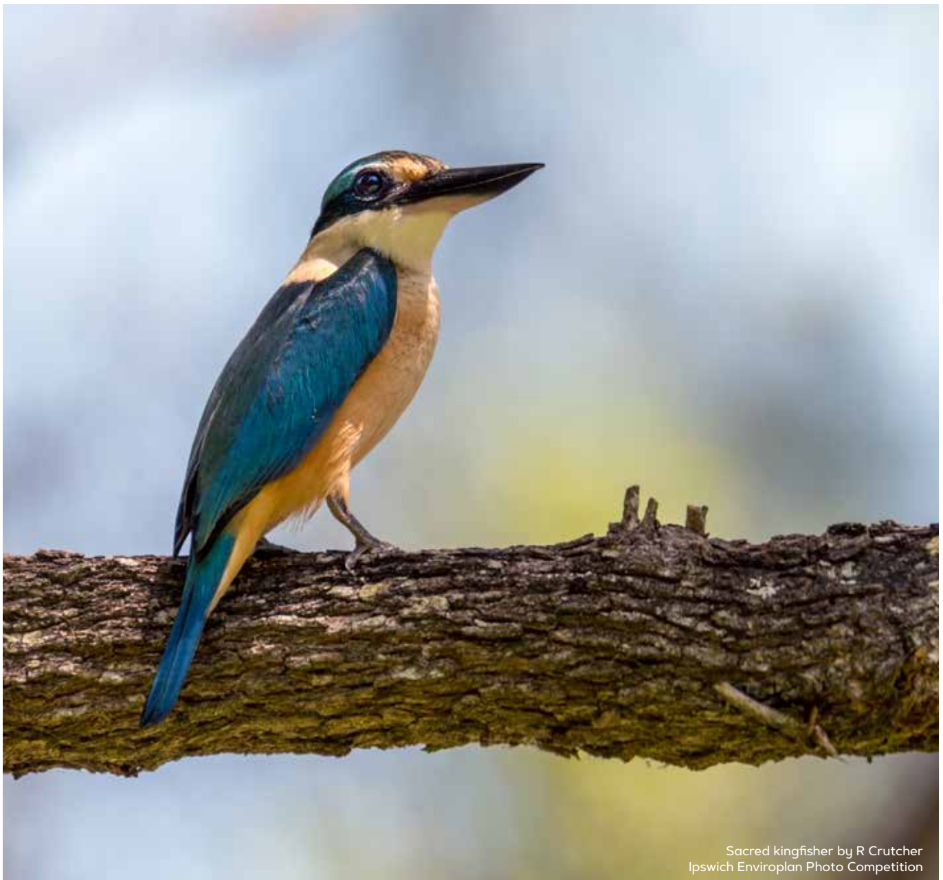
Sacred kingfisher Ipswich Enviroplan Photo Competition

Once submitted you will receive an electronic confirmation notice.