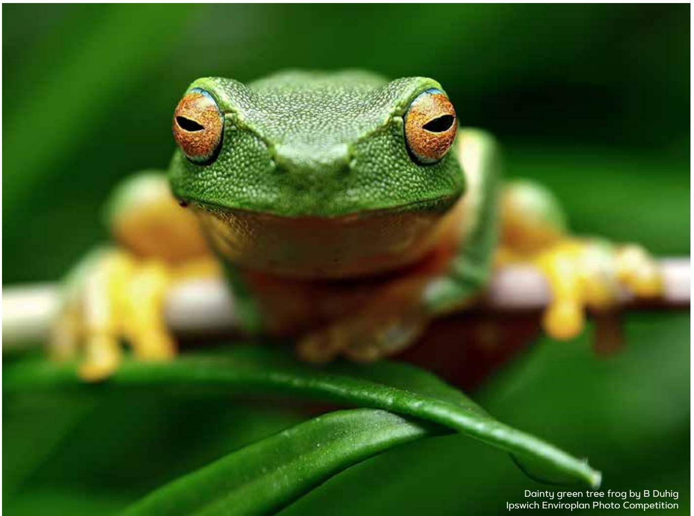
Dainty green tree frog by B Duhig Ipswich Enviroplan Photo Competition