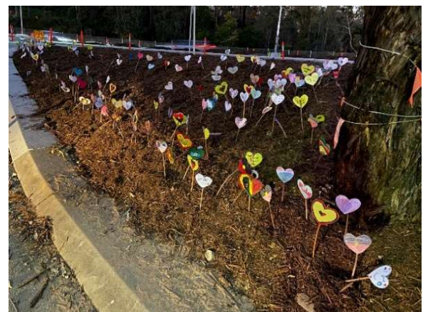
Hymba Yumba Sea of Hearts