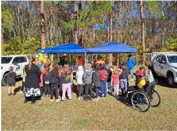
Learning about construction with BMD

We also had a lot of fun with the students and staff at the school with a meet and greet at Don Preece Oval. The BMD Team spoke to the children about the construction outside the school and the equipment used to construct the road and footpaths. We think there are some budding engineers and machinery operators with all the inquisitive questions about the diggers. Thank you to the school for hosting us.