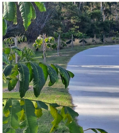
Planting along Springfield Greenbank Arterial

You may have noticed some planting activity along the Springfield Greenbank Arterial corridor recently and the greenery is a welcome sight. For Stage 1 we have planted over 20,000 trees to suit the climate and conditions of the Springfield region.