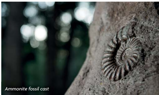
Ammonite fossil cast

Passes through a dry sclerophyll forest community which is recovering from historical mining disturbances. Scrub species such as hoop pines ( Araucaria cunninghamii ) are beginning to emerge in the gullies. Keep your eyes open for koalas in the taller Eucalypts.