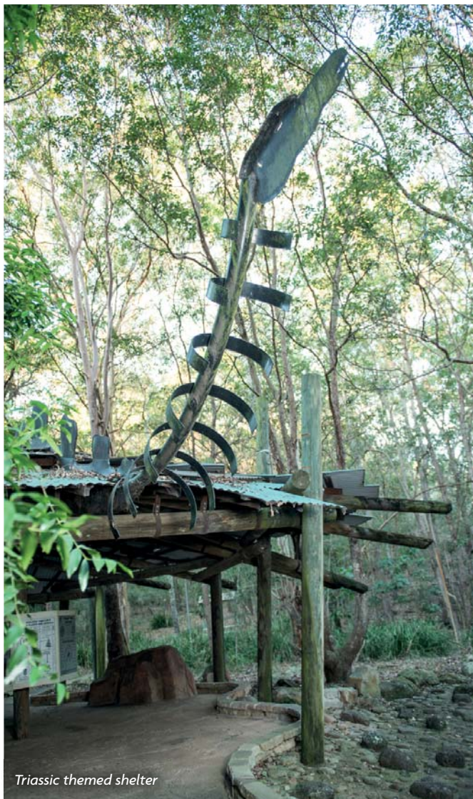
Triassic themed shelter

This park remains sacred to the Traditional Owners of Ipswich, the Yagara People, consisting of the Jagera, Yuggera and Ugarapul Clans. Sacred sites are very important to the Traditional Owners, as they provide a link between Country and personal identity and allow the passing on of cultural knowledge. Some of the sacred sites within Ipswich include quarry sites, traditional food resources, story places, pre-contact and historical camp sites, fighting grounds, ceremonial sites, bora rings and women's business sites.