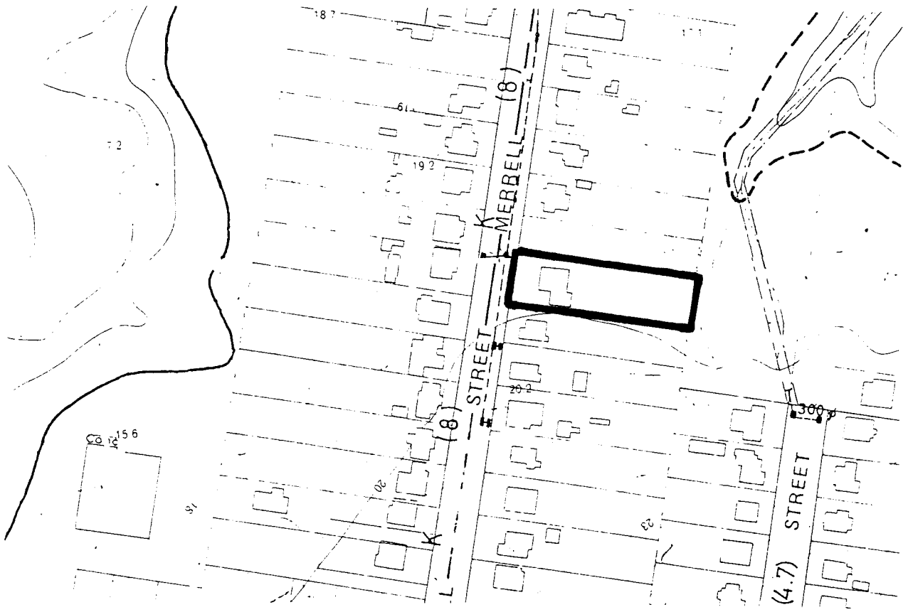
Source: Ipswich City Council. City of Ipswich topographic series. Amended to August 1990. Scale 1:2500. North at top of map. "@" = associated items.