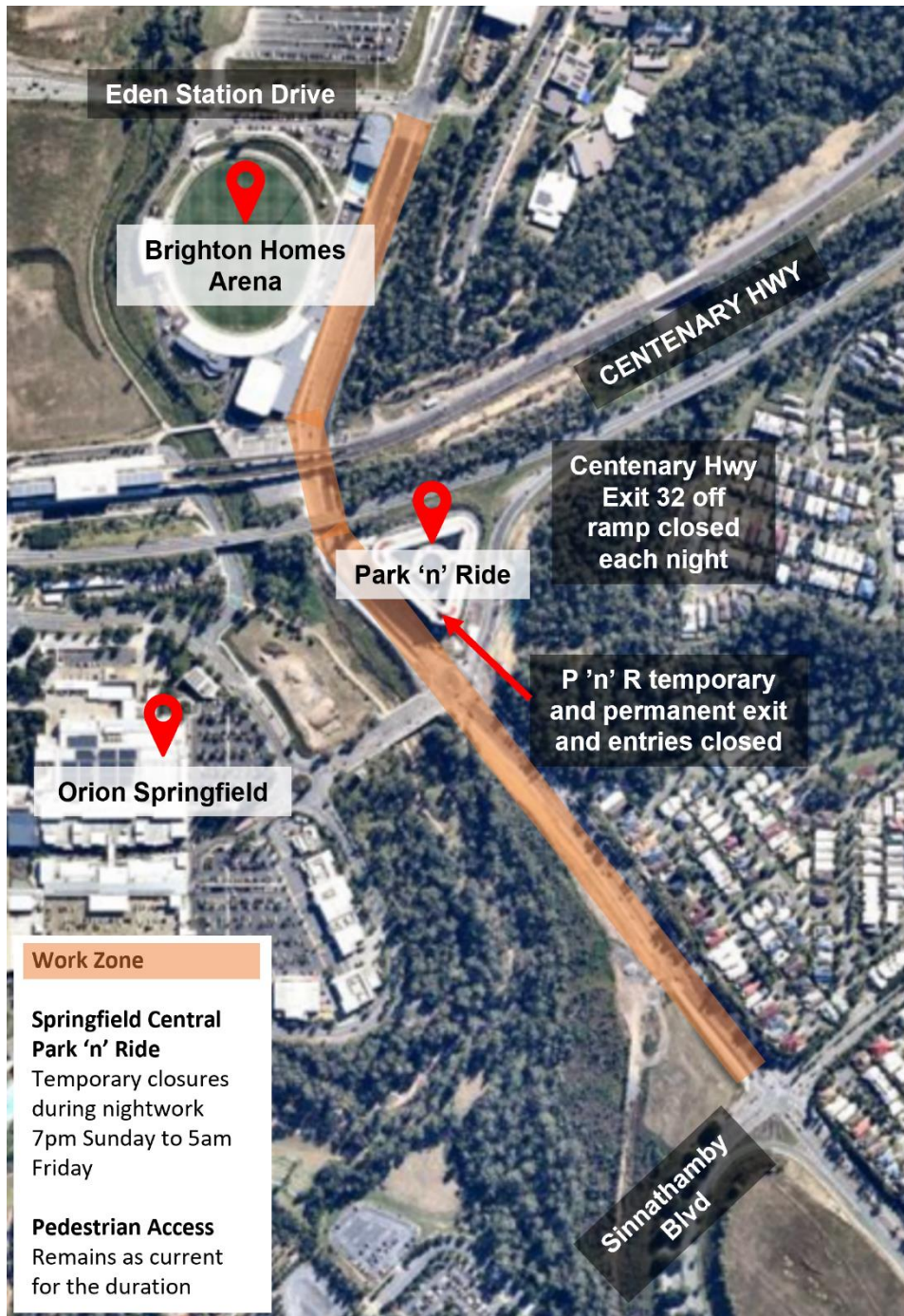
Stage 3 location of nightwork