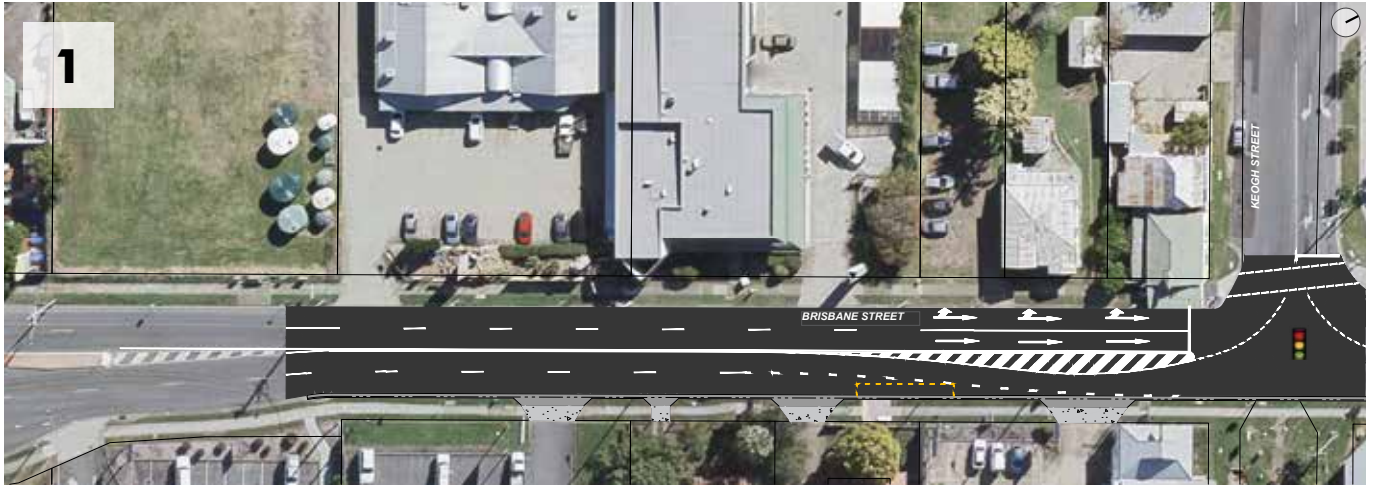
331 - 305 Brisbane Street