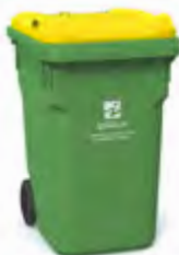
360 Litre Recycling Bin