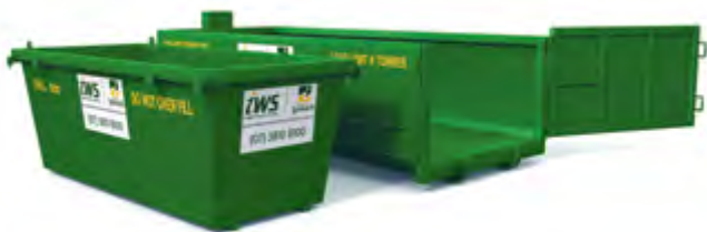
16m 3 Skip