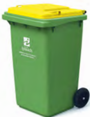
240 Litre Recycling Waste Bin