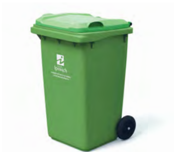
240 Litre FOGO Bin

To commence a FOGO Bin service please visit ipswich.qld.gov.au/fogo