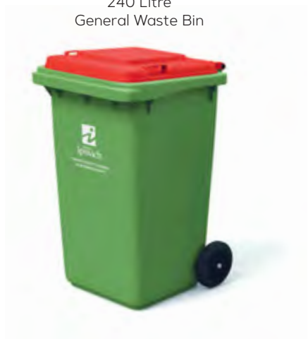
240 Litre General Waste Bin

This service is not suitable for recyclables or garden waste. Recyclable items should be placed into the yellow recycling bin and Food Organics and Garden Organics (FOGO) into the FOGO Bin.