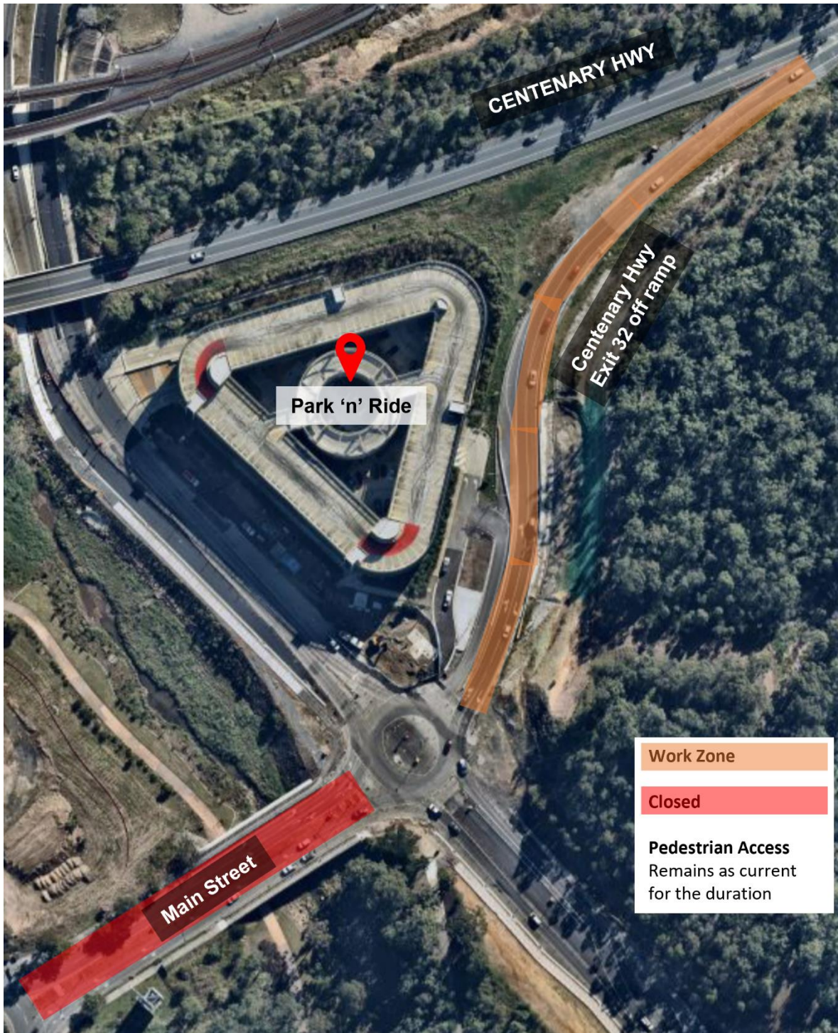
Stage 3 location of nightwork