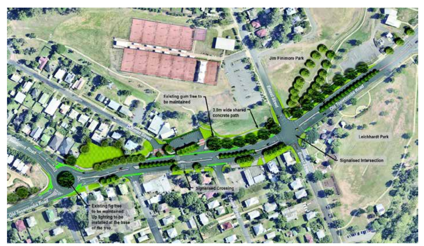
Old Toowoomba Road upgrade