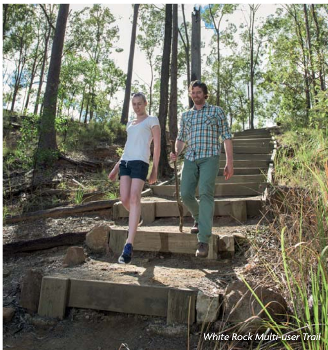
White Rock Multi-user Trail

A moderate level trail that leads you into a world of large paper barks, swamp box and blue gums. If you are lucky enough, you may even see a shy lace monitor as you walk along Six Mile Creek and through the surrounding bushland.