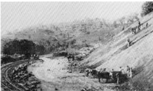
Building the railway – before the days of heavy machinery

The first Australian railway line was built in 1854 from the docks at Port Melbourne to St Kilda. Sydney's first railway opened in 1855.