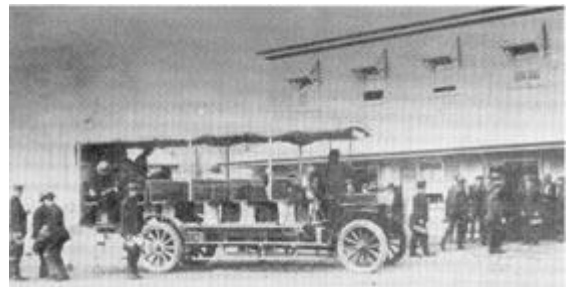
A motor bus arrives at Ipswich Railway Workshops