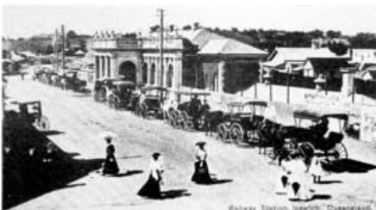
Ipswich Railway Station, Union Street in the early 20 th Century. Note the horse-drawn cabs waiting for passengers

The first road from Ipswich to Brisbane went via South Brisbane. It was not an easy road. Horsemen could travel it in less than a day, but in the 1840s, carriages and carts could take up to two days.