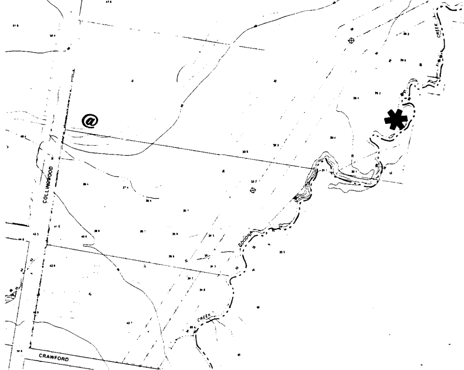
Source: Ipswich City Council. City of Ipswich topographic series. Amended to August 1990. Scale 1:3750. North at top of map. "@" = associated items.