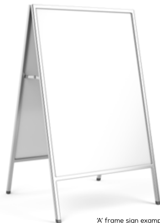
'A' frame sign example