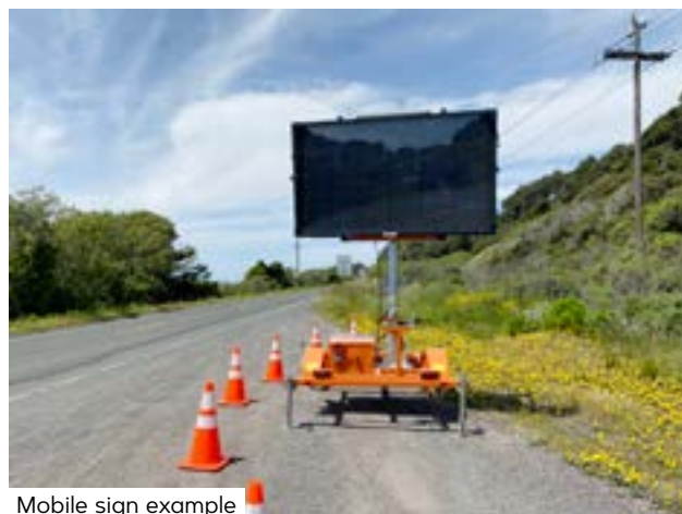
Mobile sign example

Are portable, freestanding lightweight signs (often with wheels) which can be easily moved around the site. They are permitted a maximum height of 2m and a maximum width of 1.2m.