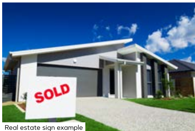
Real estate sign example