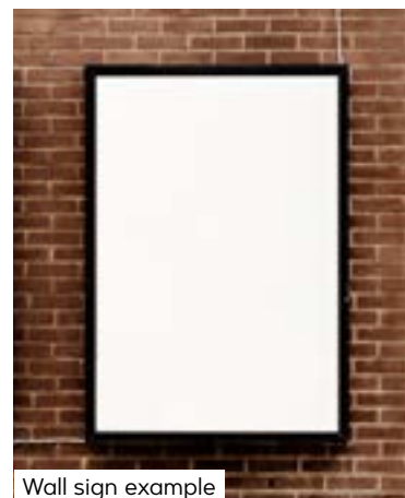
Wall sign example