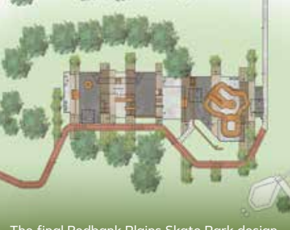
The final Redbank Plains Skate Park design

"Some of the exciting upgrades include a quarter pipe, flat bank, volcano, waterfall, flat bar, circulation bar, footpath and seating, and I can't wait to see residents enjoying the upgraded facility once complete."