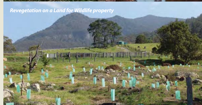
Revegetation on a Land for Wildlife property