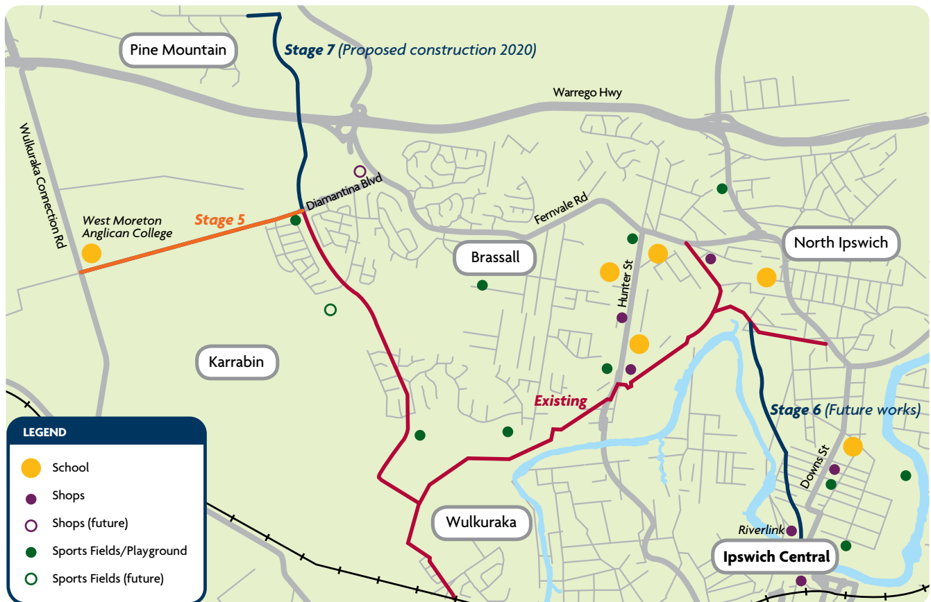
Brassall Bikeway Network

Access to the school from the the Keswick Road carpark will be maintained via one driveway entrance at all times. Changes to entry points will be signed as required. Any works outside the school will be undertaken during school holidays to minimise impacts to school traffic where possible.