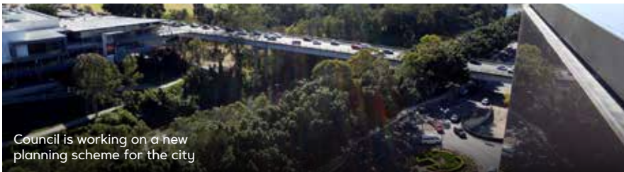
Council is working on a new planning scheme for the city

Ipswich is growing and changing, being one of the fastest growing areas in Queensland and the state's fastest growing city.